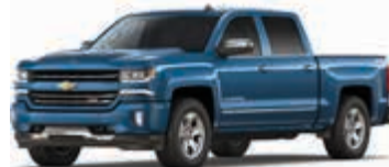
2018 Chevrolet Silverado