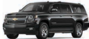
2018 Chevrolet Suburban

All makes and models • Wide selection of cars, trucks, SUVs • New and Pre-owned