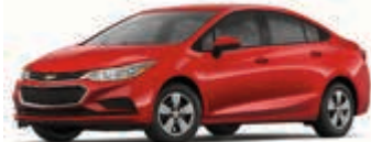
2018 Chevrolet Cruze